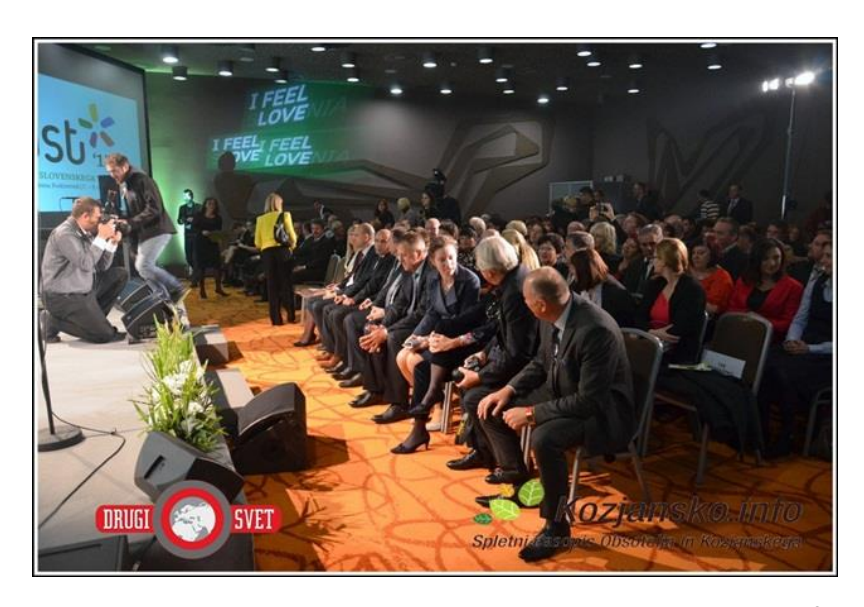
Photo: prize giving ceremony hosted by the Tourist Association of Slovenia

Podčetrtek yearly hosts about 400 events. The location of the prize giving ceremony will be in the Congress center Olimia in hall Primula, which can accommodate 400 people. During the ceremony the children of primary school Podčetrtek will perform. The ceremony will be free of charge.