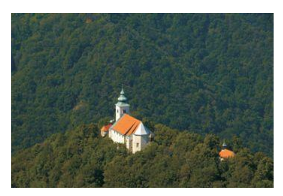
Photo: Pilgrimage church "Svete Gore" above the village Bistrica ob Sotli