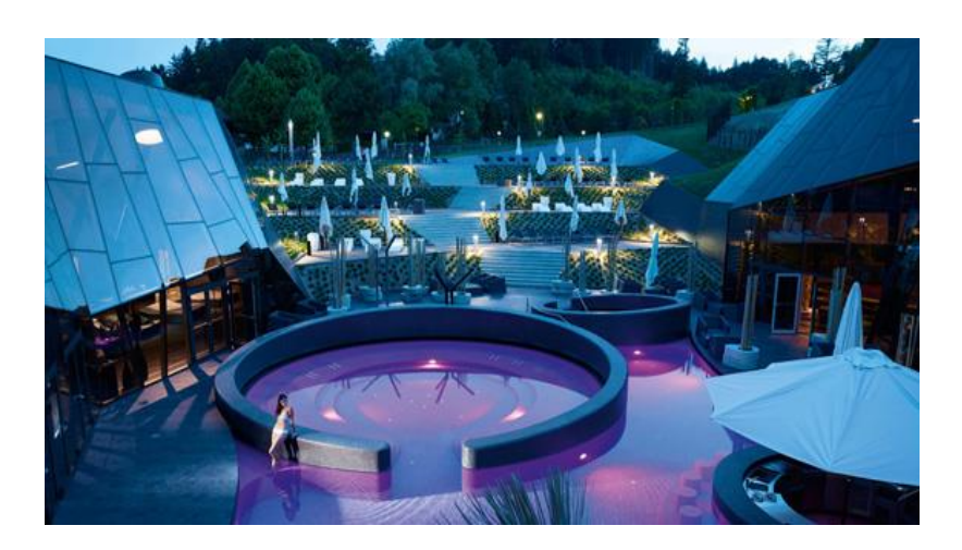
Photo: Pampering in Wellness Orhidelia – the best wellness in this part of Europe