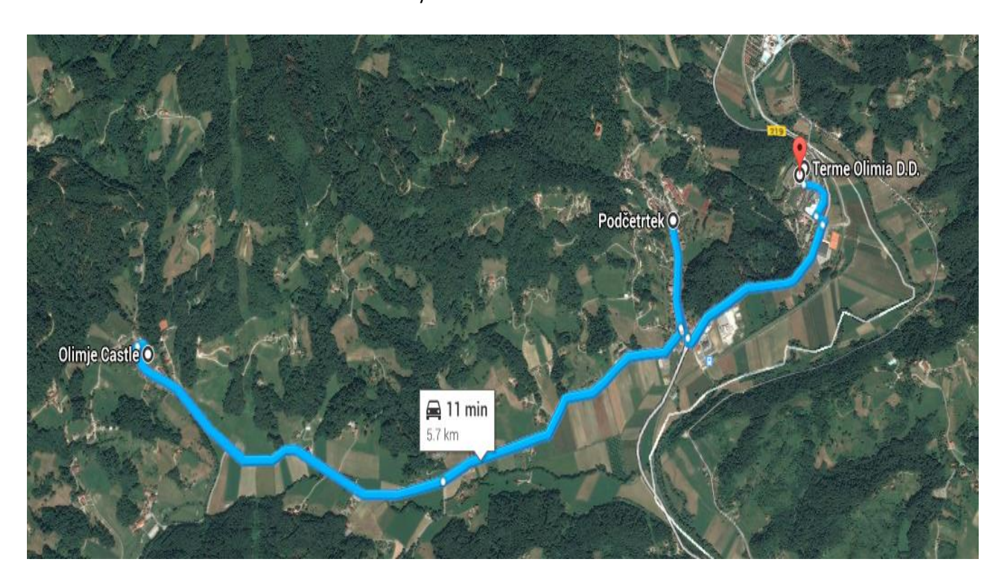
Photo: Podčetrtek tourism destination map (here you can see the closeness Terme Olimia, Podčetrtek (gold EFE 2013) and Olimje village (gold EFE 2009)

Photo: Podčetrtek in Slovenia. Motorways are also seen.